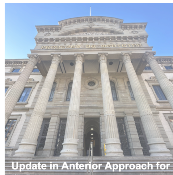
Update in Anterior Approach for Total Hip Replacement